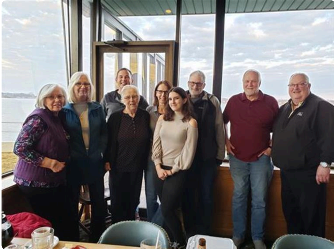
Voyageur March 2022